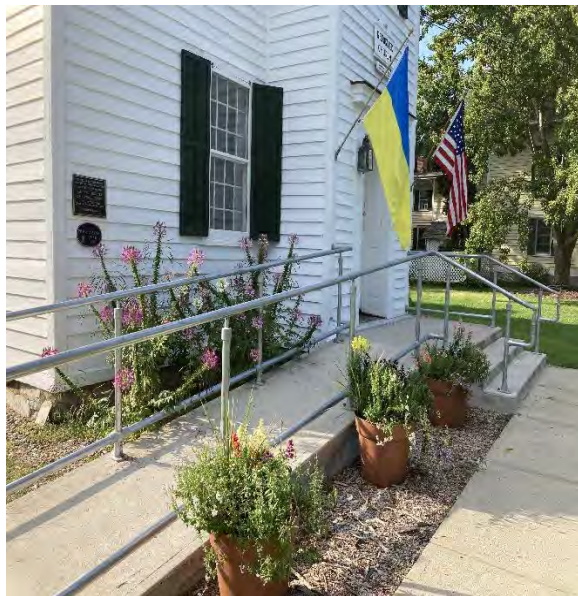
Flowers planted in front of church by Randi Sheffer. The Ukrainian flag hanging in front of church reminds of us to pray for the people suffering in that region