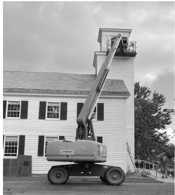
Bell Tower repairs underway, July 13, 2022

Some years ago we received the Washington County Preservation Award and our sanctuary and other properties have been placed on the National Register of Historic Places. We take pride in having maintained the properties, our heritage, which have been handed down to us over the last eight generations.