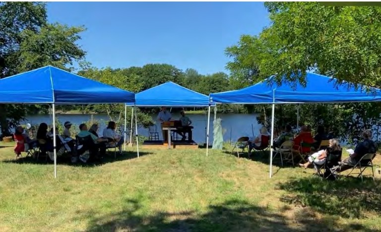
Fort Miller Reformed Church worships with nature on the riverbank of the Hudson River, July 2022

Fort Miller Reformed Church 1239 Fort Miller Road Fort Edward, NY 12828